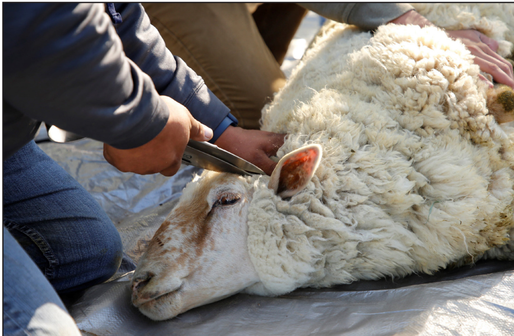
NOEL LYN SMITH | FARMINGTON (NEW MEXICO) DAILY TIMES