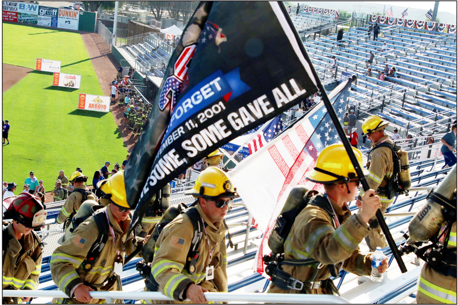
STEVE BORTSTEIN | FARMINGTON (NEW MEXICO) DAILY TIMES