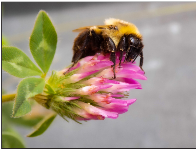
ELIZABETH ODELL | SUMMERLAND ADVOCATE-MESSENGER, CLEARWATER, NEBRASKA

HANGING OUT — A honeybee hangs out on a red clover blossom during a cool September morning. (October 1, 2020)